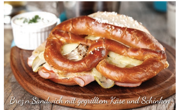
Brez'n Sandwich mit gegrilltem Käse und Schinken