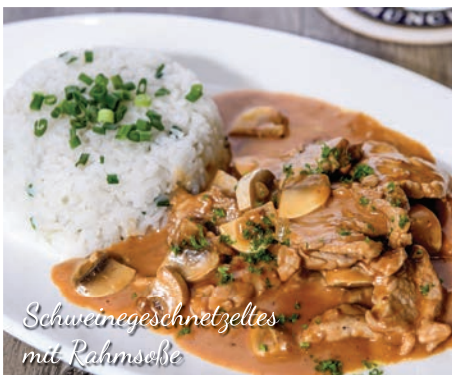
Schweinegeschmetzeltes mit Rahmsoße