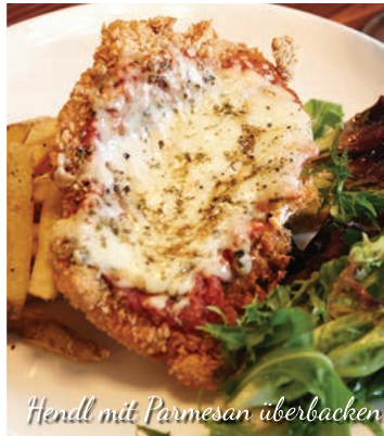
Hendl mit Parmesan überbacken