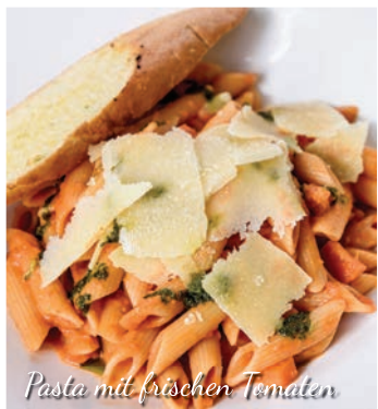
Pasta mit frischen Tomaten