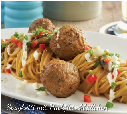
Spaghetti mit Hackfleischbällchen